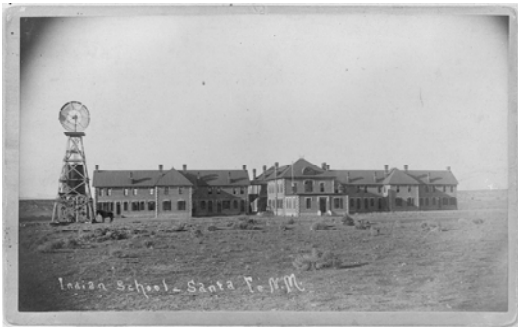
"Santa Fe Indian School", n.d., Image No. 1543, New Mexico Department of Tourism Photograph Collection